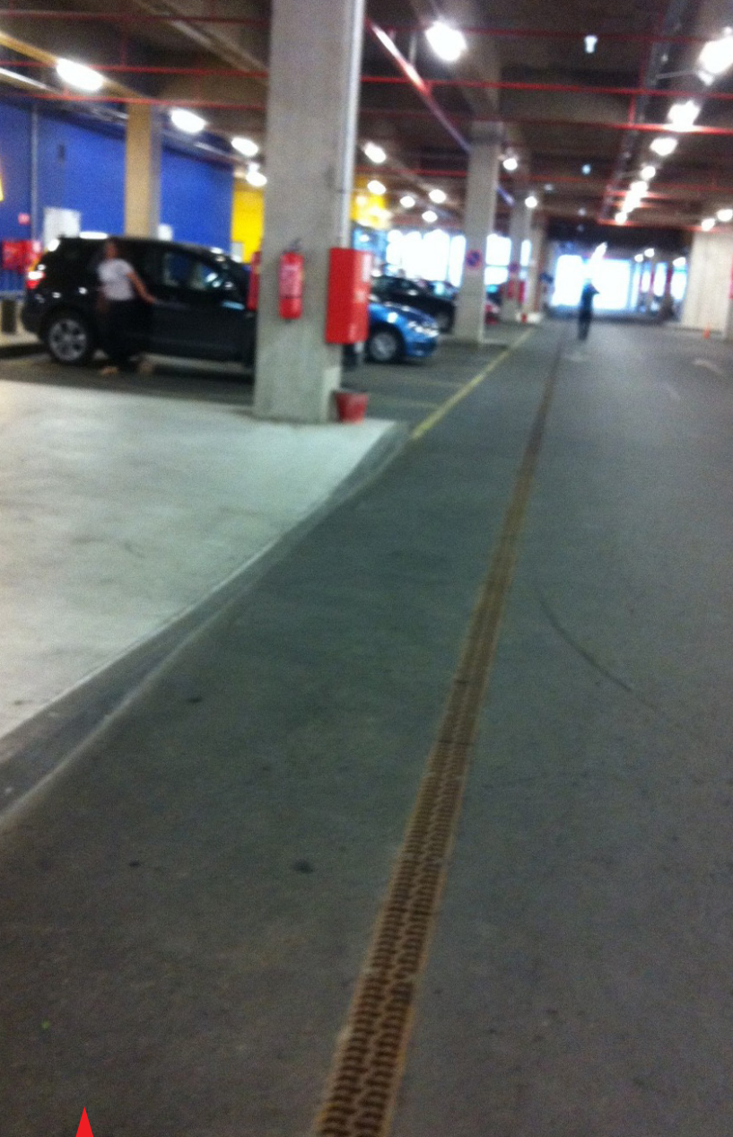
ACO MultiDrain - line drainage