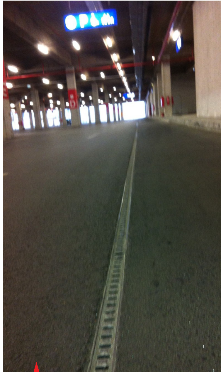
ACO Qmax - line drainage