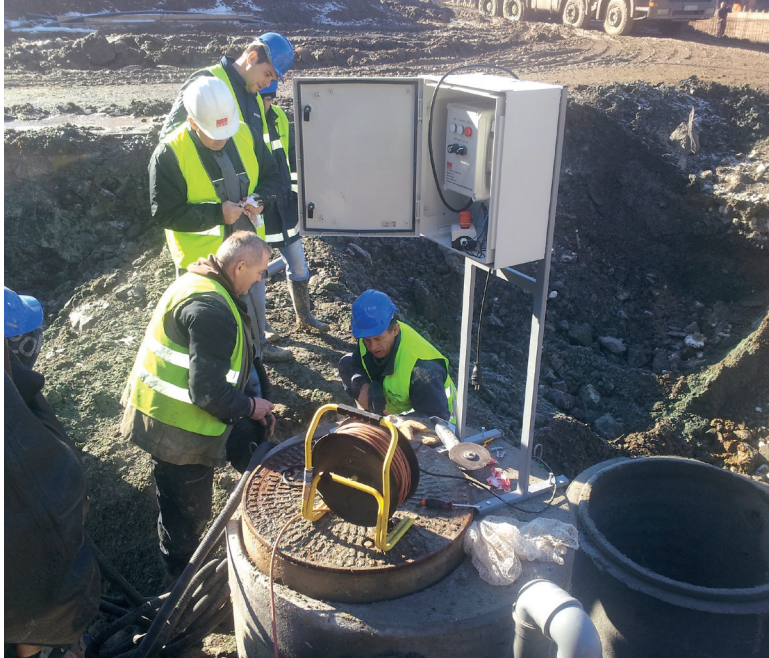
ACO hazardous liquids treatment system