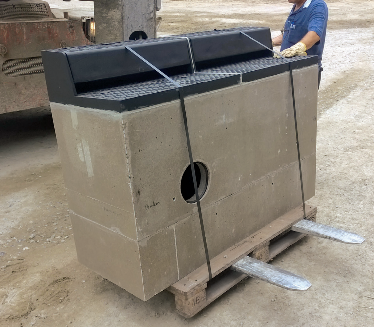
ACO sump unit type "Progon"