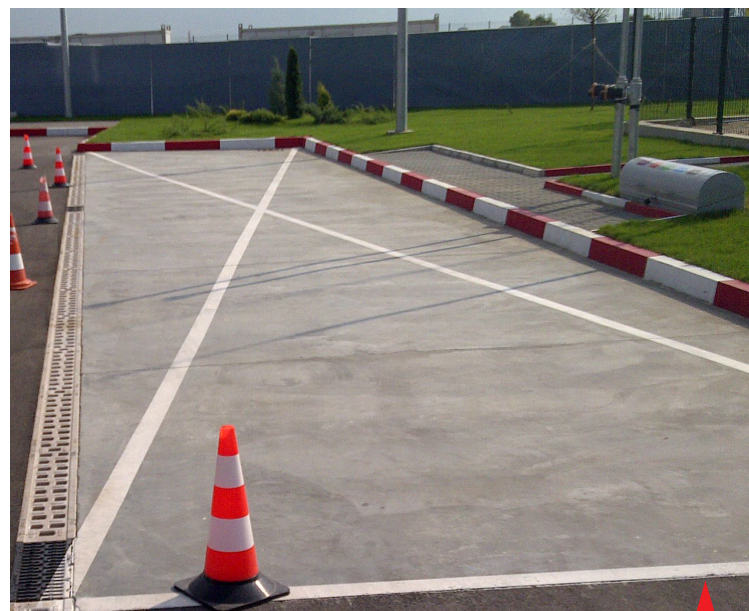
ACO ECO Plus oil separator is installed in the restricted service area