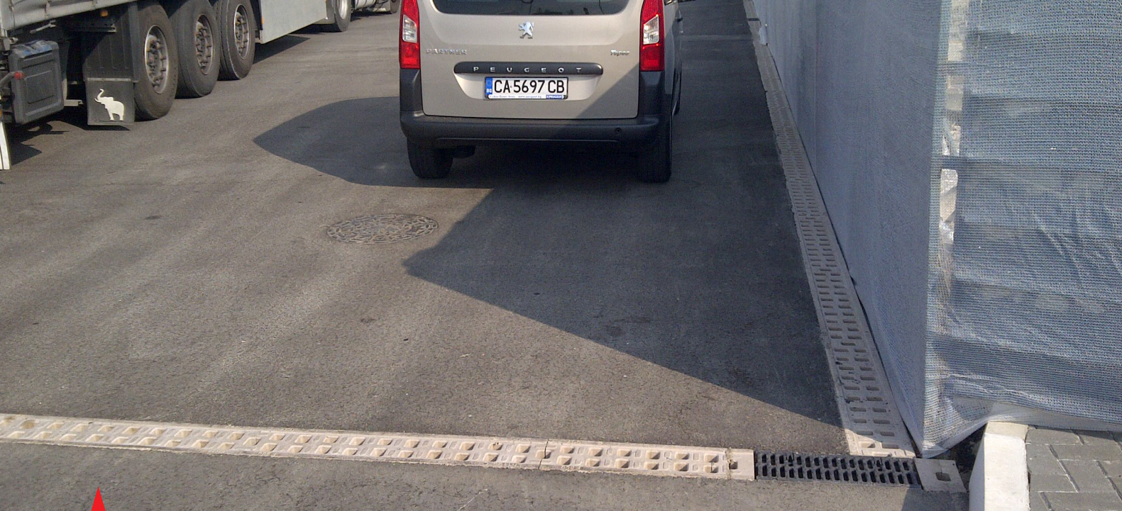
The ACO Monoblock drainage channels are a reliable solution for the heavy traffic