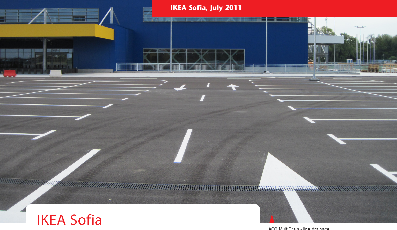
Surface Wate Management and building drainage solution

The first outlet of the Swedish furniture and home decoration company IKEA opens in Bulgaria in September 2011 in Sofia. The project includes more than 29 000 sq.m. building as well as open and underground parking with places for 1200 vehicles. Line drainage system ACO DRAIN®