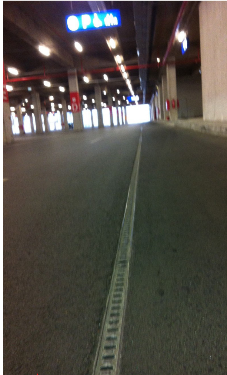
ACO MultiDrain - line drainage